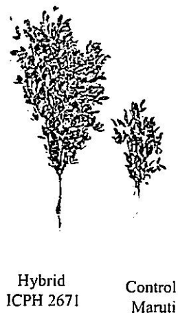
Fig 1: Comparison of seedling vigor in hybrid and control

requirements of the hybrids could be reduced by a significant margin. This is an important attribute of hybrids as the hybrid seed input cost to the farmers will remain within affordable limits of resource poor pigeonpea farmers. The detailed studies with recently developed CMS-based hybrids in different maturity groups are needed to develop an efficient hybrid production package.