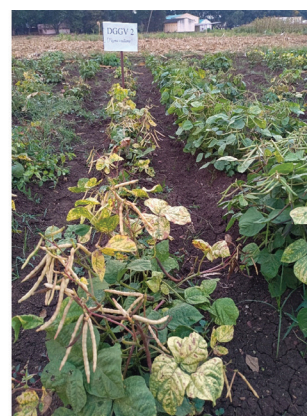
Highly susceptible check (DGGV 2)

derived from the use of 0.1, 0.2 and 0.3% EMS, respectively (Table 2, 3 and 4). The highest yield of 32.0 g was produced by the mutant 2-9-10. This considerable increase in yield is owing to an increase in the number of clusters plant -1 (16), the number of pods cluster -1 (5), and the number of pods plant -1 (80) while check DGGV 2 had an average of 4.6 productive branches, 5.0 clusters plant -1 , 3.6 pods cluster -1 , 18.5 pods plant -1 and mean seed yield of 11.7 g per plant. The poor performance of the control plants was due to susceptibility to MYMV disease. Likewise, mutants 2-5-9 and 3-6-10 recorded seed